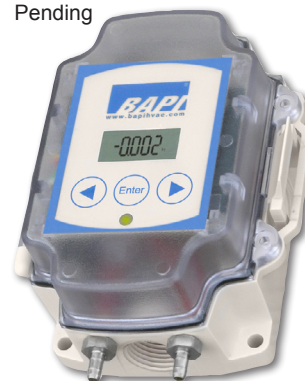
Touch Pressure Sensor in the BAPI-Box